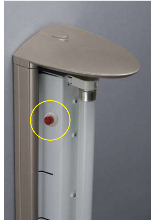
One-piece indicator light/test switch is built into every luminaire that features the XEM option.

Installation: All XEM boxes conform to NFPA Section A.8.2.3.2.4.2, with a wall opening of less than 16 square inches. Vertical installation shown below.