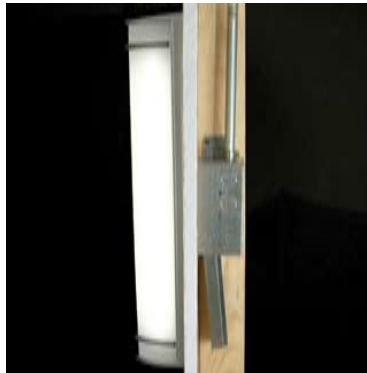
2.5" XEM box accommodates both horizontal and vertical mounting of linear luminaires.