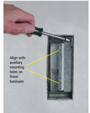
Tighten hex nut on stud. Holes on luminaire mounting bracket align with auxiliary mounting holes on linear luminaire.