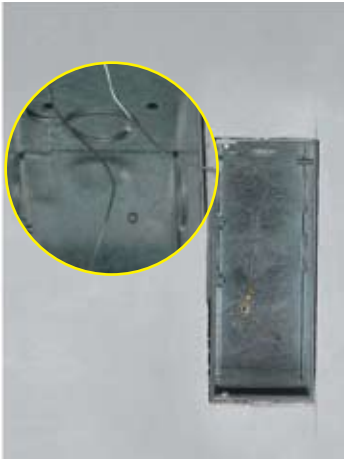
XEM box (provided) replaces standard junction box for rough-in installation. Multiple options for wiring access available through knockouts (inset). Notches in mounting bracket indicate correct placement for 1/2", 5/8" and 1" wallboard.

Installation: All XEM boxes conform to NFPA Section A.8.2.3.2.4.2, with a wall opening of less than 16 square inches. Vertical installation shown below.