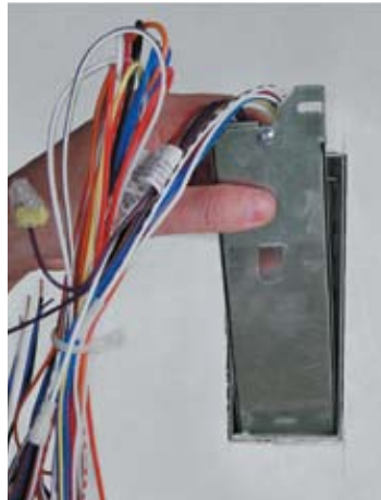
Insert emergency battery pack and bracket through hole in bottom of XEM box. Tab on battery bracket holds pack in place during wiring. Bracket then hooks to stud on side of XEM box.