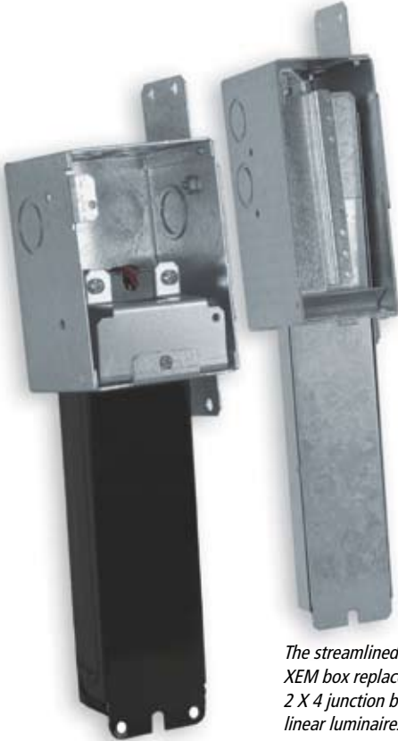
The 4" XEM box replaces the standard junction box.

EMERGENCY POWER AT THE JUNCTION BOX MEANS YOU CAN USE VIRTUALLY ANY LINEAR LUMINAIRE AS YOUR EMERGENCY LIGHT SOURCE