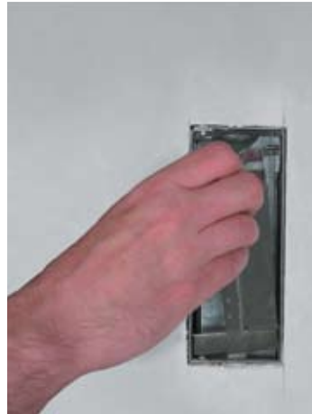
Insert tab at bottom of luminaire mounting bracket into slot in XEM box and hooks to same stud to secure battery pack in place.